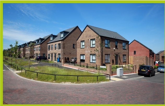
Above: Homes at Prince's Gardens

In addition, Sigma's Simple Life donated £13,000 to local primary school, St Theresa's, which helped to build and stock a new library and establish a relaxation and sensory room for the children.