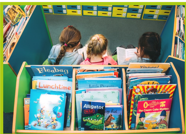
Above: St Theresa's Library